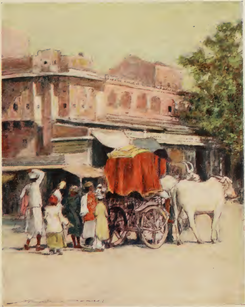
A NATIVE BULLUCK CART. Page 80.