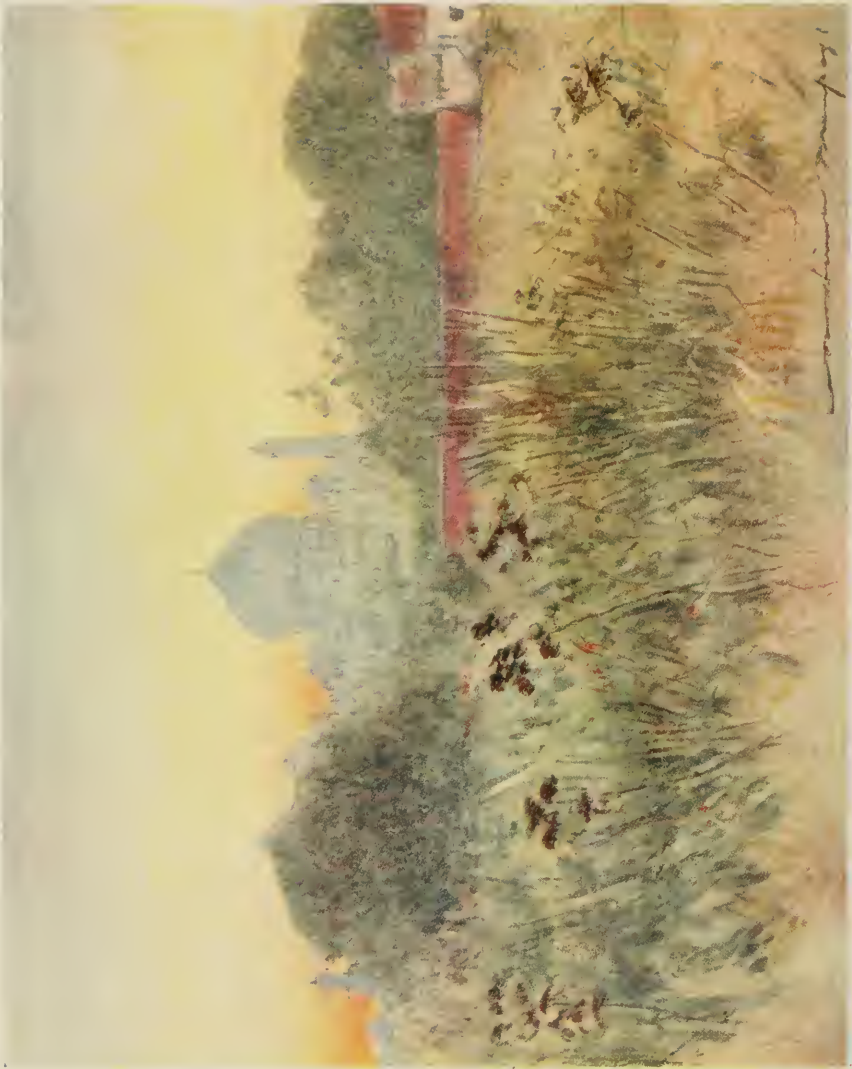
THE TAJ MAHAL. FRANCE.