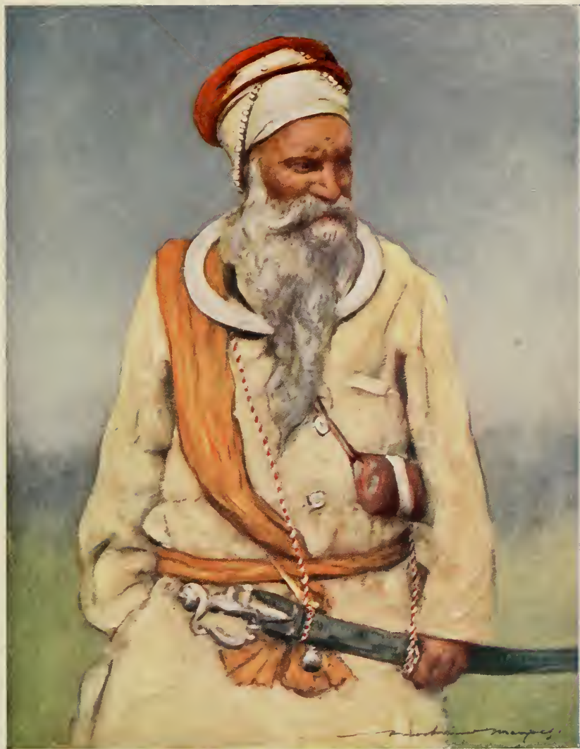
A SIKH WARRIOR. Page 17