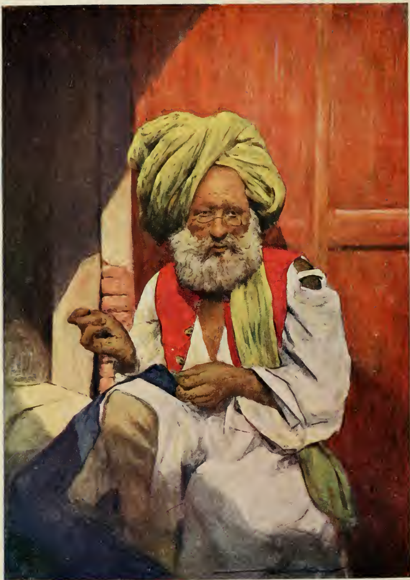
A TAILOR AT WORK. Page 1.