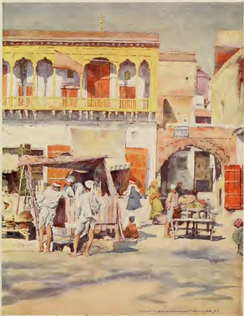
A BAZAAR DELHI, Chapter XVI.