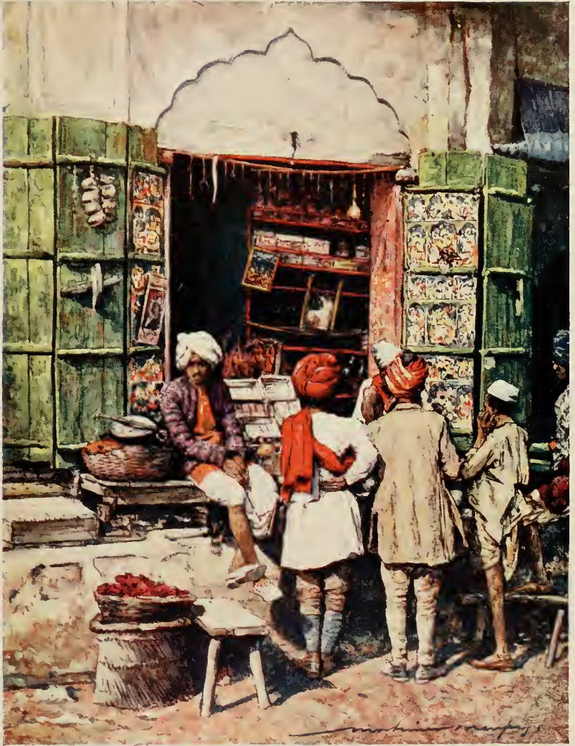
A BUSY BAZAAR. Chapter XVI.