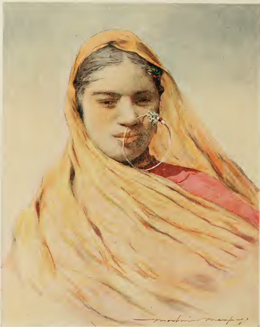
A NATIVE WOMAN WEARING NOSE ORNAMENT. Page 57.