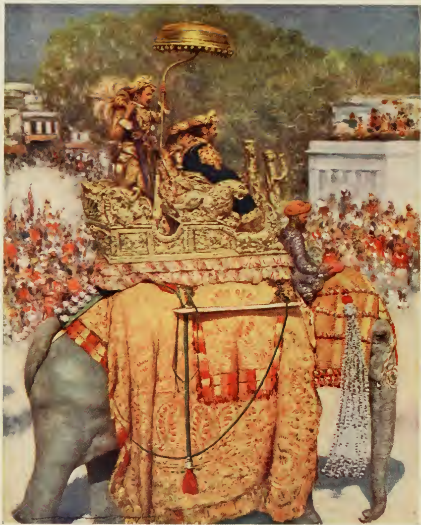
A DISTINGUISHED MAHARAJAH Pages 11 and 12.